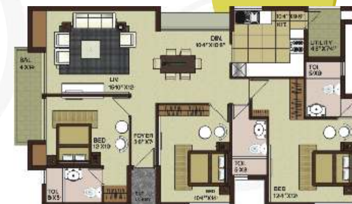
3 BHK Option 2