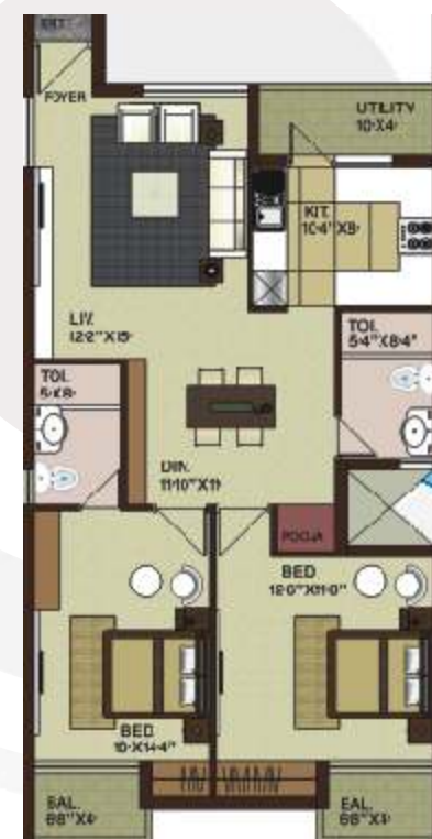
2 BHK Option 1