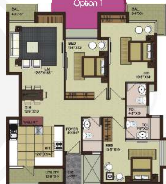
3 BHK Option 1