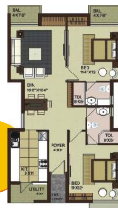
2 BHK Option 2